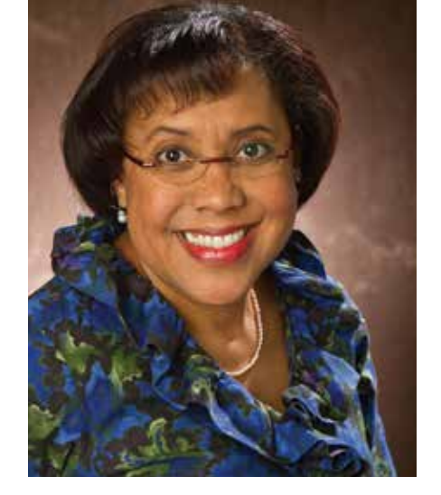
A message from the director,