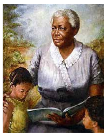
Lucy Craft Laney's portrait was the first portrait of an African American woman to be displayed in the Georgia state capitol.

Laney was a forward-thinking person. She believed that the only way for Black people to be successful in America was by being well educated. She also believed that in order for the race to continue, its women must be educated as well. Her students studied the classics, Latin, algebra and various trades. She produced well-rounded young adults who also studied the arts and