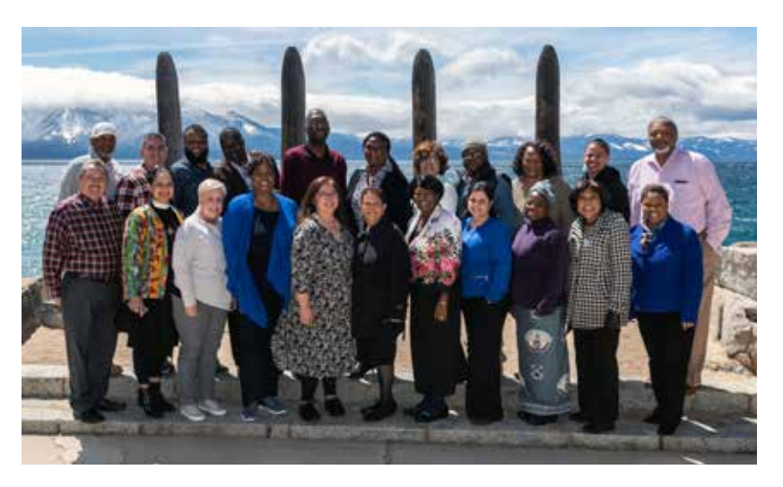
Racial Equity & Women's Intercultural Ministries provide opportunities for leadership development for leaders and women color throughout the PC(USA.)

In Racial Equity & Women's Intercultural Ministries, we are committed to providing opportunities for leadership development, so we inaugurated Leadership Institutes for leaders of color and women. The first institute was the Racial Ethnic Clergywomen's Leadership Institute held at Montreat