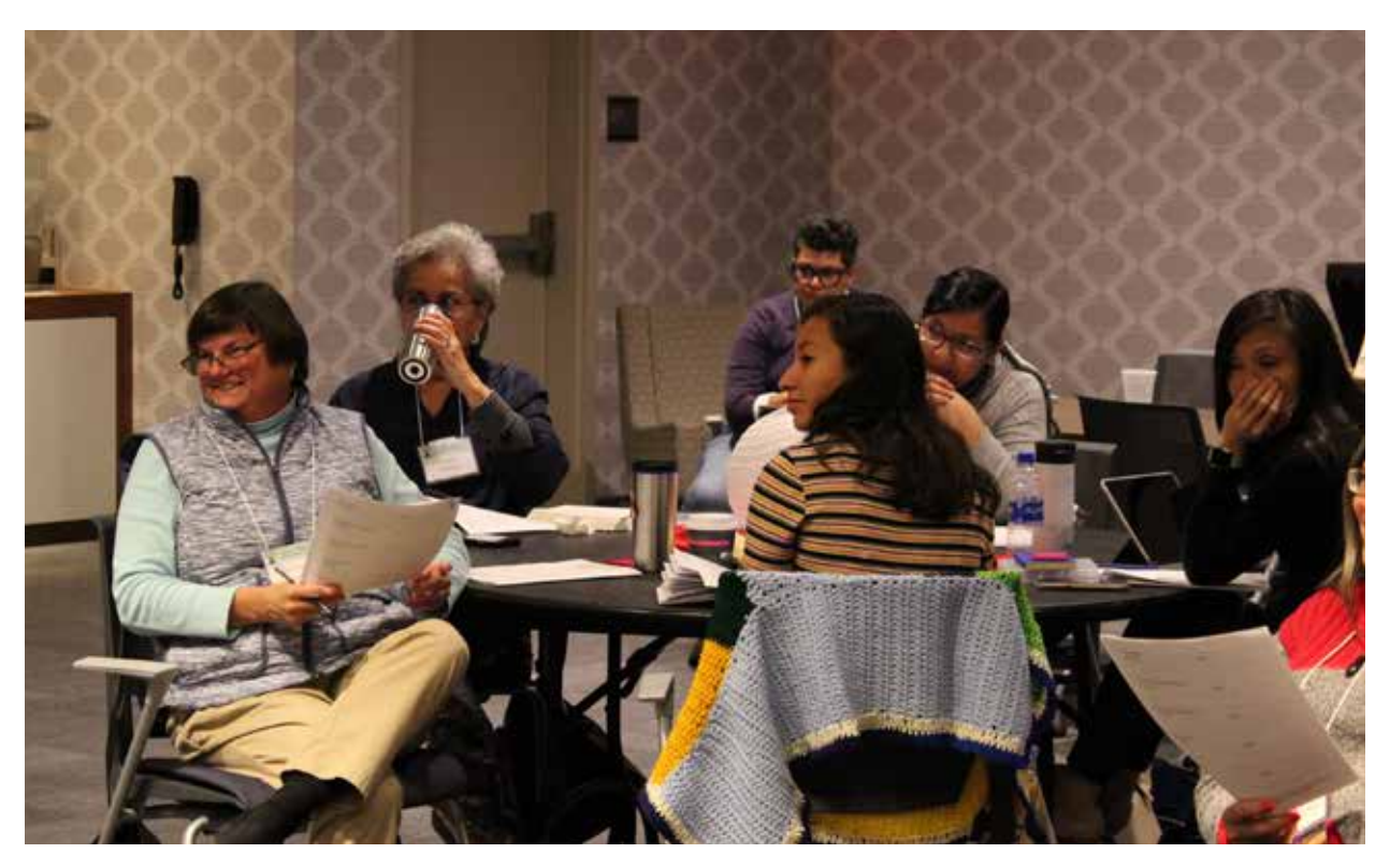
About 30 women have gathered in Louisville for the first Leadership Development Institute for Latina/Hispanic Women in Leadership.